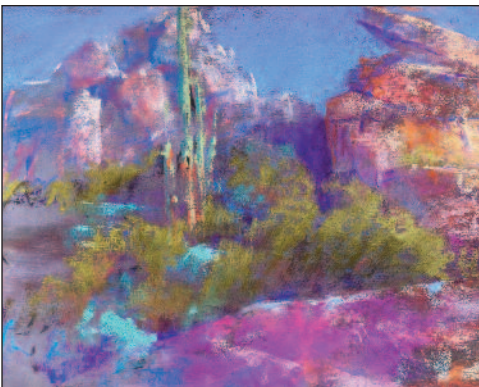
Plein air pastel during the week of February 6 at the Boulders.