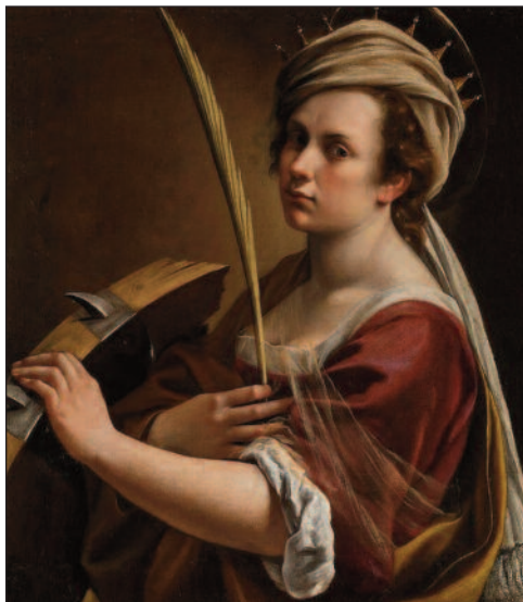
Self-Portrait as Saint Catherine of Alexandria, 1615–1617 by the Italian Baroque artist Artemisia Gentileschi.

Back in 1610, women weren't autonomous. They were expected to marry young and bear children. Women who wanted to become artists could not study anatomy or life drawing. As a young girl, Artemisia Gentileschi learned how to draw, mix color, and paint. Her father, Orazio, was an ac-