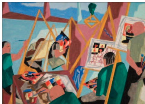
Jacob Lawrence. Creative Therapy. Casein over graphite, 1949. One of the paintings he did while at the Hillside Hospital in Queens.

When bad stuff happens, people tend to quit everything to dwell in misery. While it is normal to feel anxious in the face of uncertainty or to mourn a loss for a period of time, creative resilience calls for a more active stance.