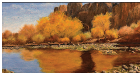
Ed Botkin's Golden Reflection , Oil