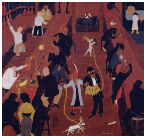
Jacob Lawrence. Bar 'n Grill. Casein on paper, 1937.

moved to New York to reunite with his mother. By his own account, moving to Harlem was the best thing that could have happened to him.