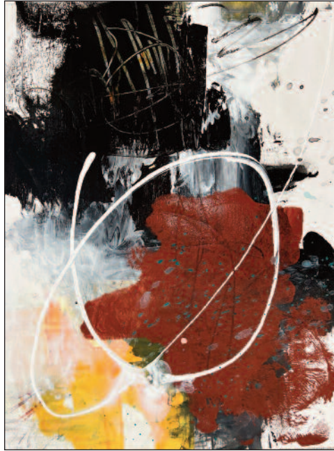
Kathy Brancheau's Coming Back Around , First Place Acrylic