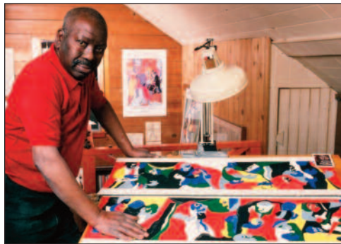
Jacob Lawrence in his Seattle, WA studio in 1986.

Jacob Lawrence was the first African American artist who gained wide respect and recognition in the art world in the United States. He became extremely successful critically and commercially.