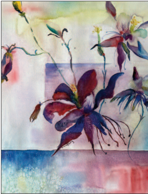
Jackie Kingsbury's Out of the Box , Honorable Mention Watercolor